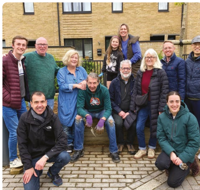
Rodney Place residents and neighbours working together on a gardening project.

If you have a neighbour, you would like to celebrate we'd love to hear from you. Tell us about your neighbour and we will give them special mention in a future update and enter them into a prize draw for a chance to win a £50 gift card .