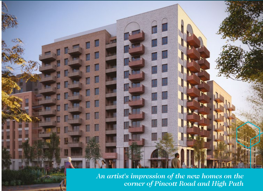
An artist's impression of the new homes on the corner of Pincott Road and High Path

We encourage you to contact the team to update your housing needs and let us know about changes to your personal circumstances that may affect the type of home you need.