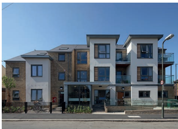
Gresham House exterior

Residents were involved in the designs and consulted at every stage. We also made sure they were supported during the moving process.