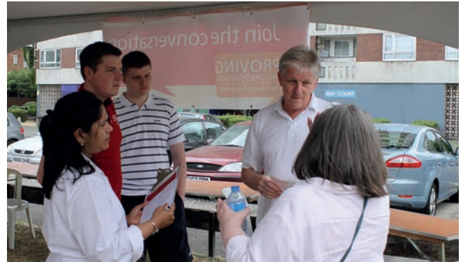
Summer consultation event

There'll be lots of further opportunities for you to raise new points by taking part in our consultation on the initial design stage.